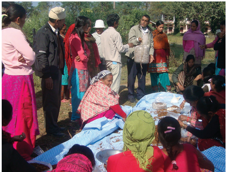
INCREASED YIELDS: Mushroom farmers say their yields and incomes have increase as a result of Agyauli Community Library's ICT training and information service.

The library serves Nawalparasi district, where over 80% of people are small-scale farmers. It connects farmers to agricultural experts and answers their questions through the internet, radio and film. In less than a year (2011/12), the Practical Answers service received 995 questions on topics including organic farming, plant diseases and funding. Working with MEDICT (Mobilization for Education and Development through ICT) the library provides information relevant to the local context and builds farmers' ICT and business skills. In 2012 the service won an EIFL Public Library Innovation Award for contribution to economic wellbeing of the community. http://bit.ly/1ndOcSt