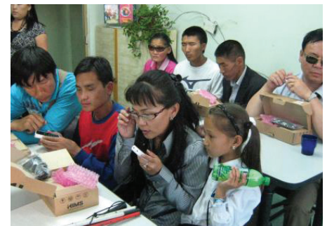
TALKING BOOKS: Blind and visually impaired people of all ages are learning to use DAISY digital talking book readers through Ulaanbaatar Public Library's service.

impaired people were visiting rural libraries, but after just one year (2010/11), 21 rural libraries reported an average of three visitors a day. Book titles include vocational skills manuals, and the service is helping visually impaired people into employment and further education. http://bit.ly/1opmxza