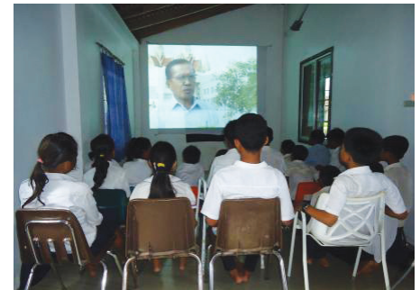
LIVING HISTORY: Students, villagers and teachers watch and discuss filmed interviews with survivors of the brutal Pol Pot regime in the library's new film viewing room.

understanding between the generations. In 2010/11, the library collected 115 interviews with villagers. Inspired by the project, a donor funded construction of a film viewing room, where villagers, teachers and students now watch and discuss the interviews. http://bit.ly/1qqAnUJ