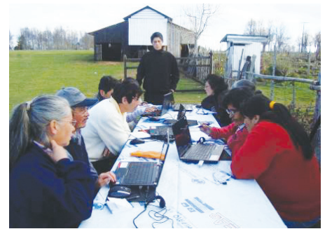
REACHING FARMERS: Panguipulli Public Library No. 296 travels to remote farming communities in the Andes Mountains to conduct ICT training.

community, and has a meeting room that that open to the community and community organizations. Farm support agencies use the room to meet farmers and to present lectures, and farmers use the space to meet other farmers and to read the library's collection of agricultural books and journals. http://bit.ly/1s1QaNB