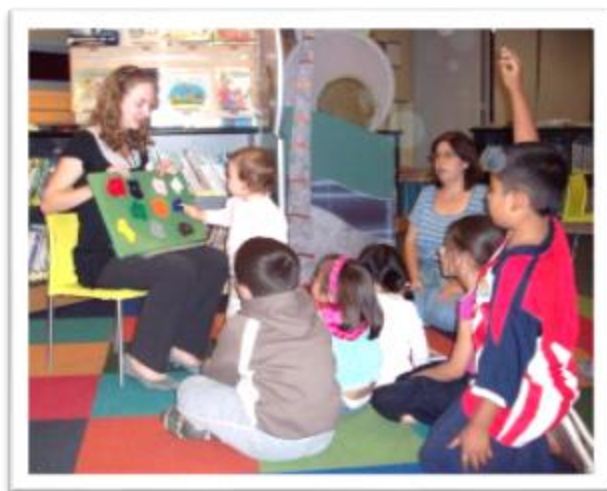
Photo: Monster Storytime, by San Jose Public Library on Flickr CC BY-SA 2.0